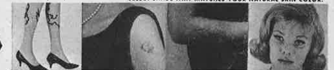
UGLY LEG VEINS BIRTH MARKS UGLY SCARS DARK CIRCLES